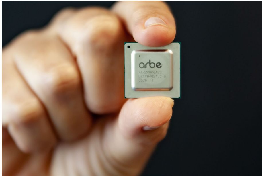
Arbe's Radar Processor Chip

Arbe's real-time 4D imaging radar consists of a Phoenix chipset, including radar sensors and artificial intelligence (AI)-based processing. The chipset leverages a 22 nanometer FDX, which reduces the power consumption per channel and increases channel isolation. This process allows for additional virtual channels on the chipset, while reducing the silicon's size and provides higher efficiency and a competitive price point for the system. This always-available, object detection also offers automatic interference avoidance and mitigation against other FMCW radar systems.